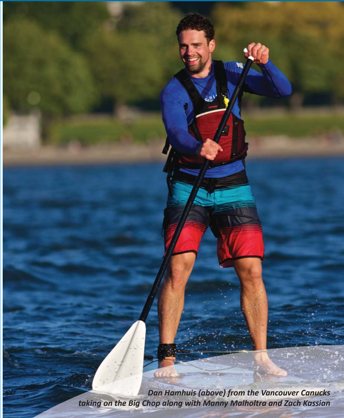
Dan Hamhuis (above) from the Vancouver Canucks taking on the Big Chop along with Manny Malholtra and Zach Kassian